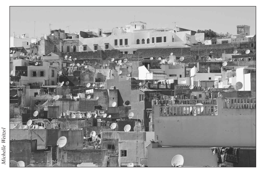
Satellite dishes atop roofs in Tangier, Morocco.

Yet the category of the Middle East does make considerable sense given the shared historical experiences of the spread of Islam, the reach of the Ottoman Empire, and the experiences of European colonialism. The Arab world shares linguistic as well as cultural similarities, although a Syrian, a Moroccan, and an Omani, for example, could easily find much that is different in terms of their actual life experiences. The Islamic world, similarly, has limitations as a category, even though Muslims globally identify themselves as part of a broader Muslim community, or umma. But Muslims—the followers of the Islamic faith—make up a fifth of the global population with some 1.8 billion. Of that number, only some 270 million—less than a sixth of the total—live in the Arab world. The point is not to settle on a better or more accurate category—favoring Middle East over Islamic world or Arab world—but to recognize the myriad ways in which the region coheres as a whole around some issues and less so around others.